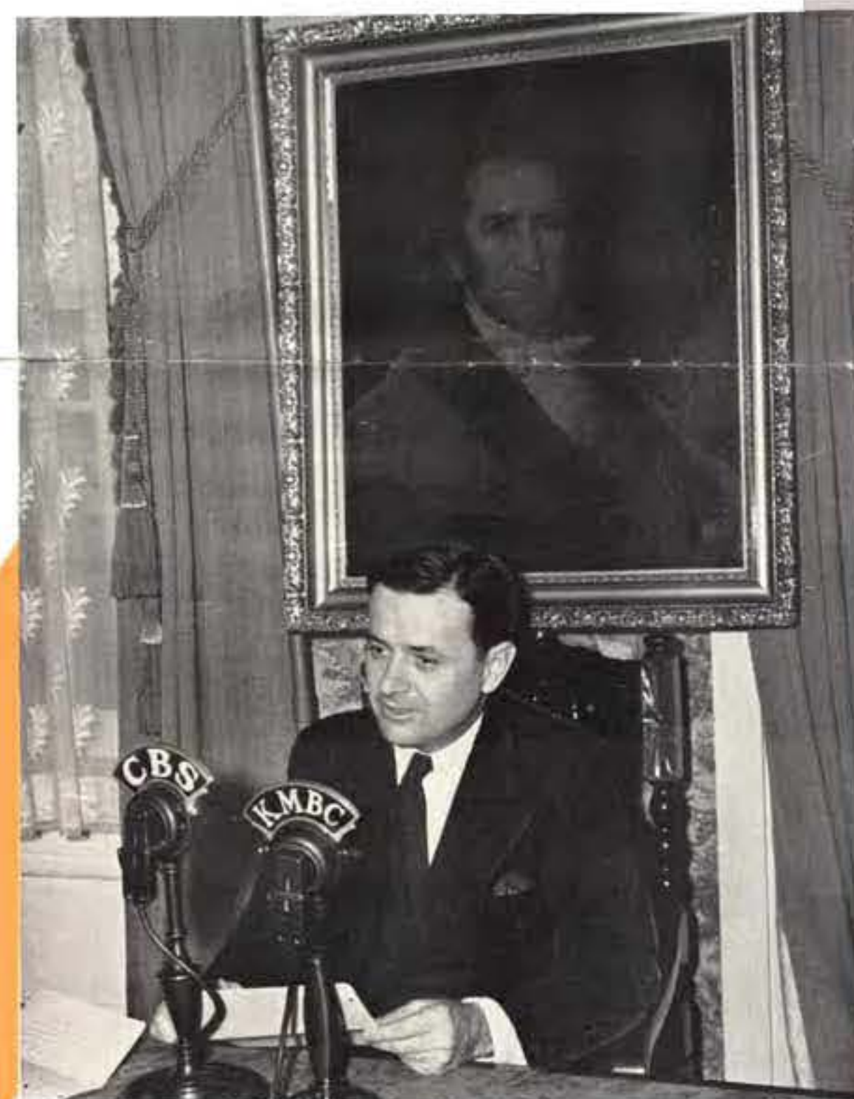
Former Governor James V. Allred speaking from the Sam Houston Room of the Executive Mansion in Austin, Texas, to the coast-to-coast network of Columbia, to commission the Texas Rangers of KMBC as "Honorary Texas Rangers."