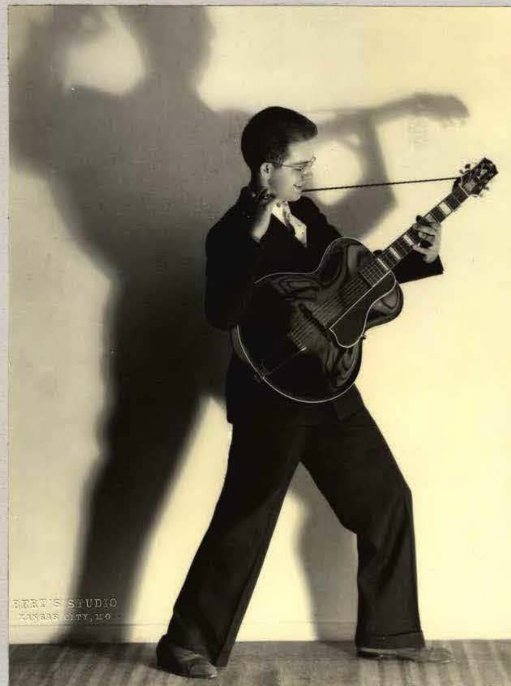
BERT'S STUDIO KANSAS CITY, MO